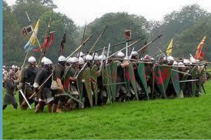
Battle Of Hastings - 1066

Cut out the picture and write the information underneath as they are glued into Chronological Order.