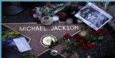
Michael Jackson dies - 2009