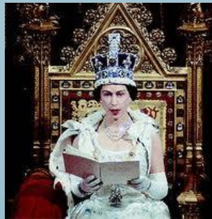
Elizabeth became Queen - 1952