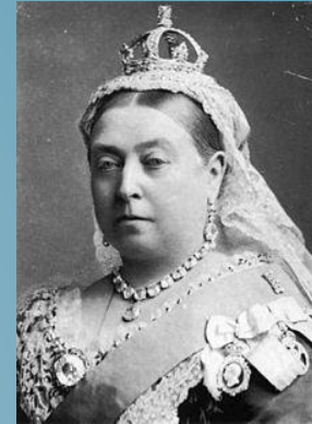
Queen Victoria is born - 1819