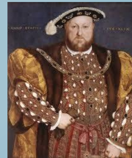
Henry became King - 1509