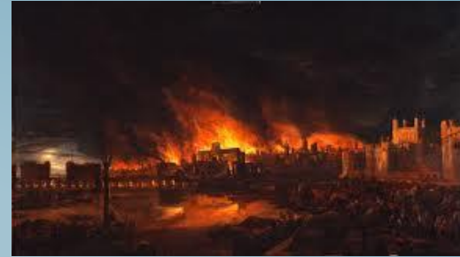
Great fire of London - 1666