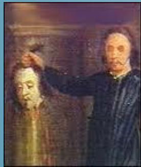
King Charles was executed - 1649