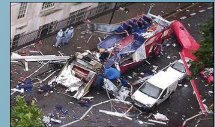
London Bombings 2005