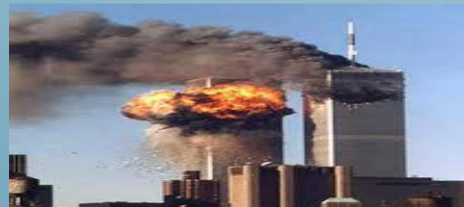
American Terrorist Attack - 2001