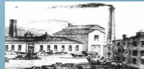
Industrial Revolution begins - 1750