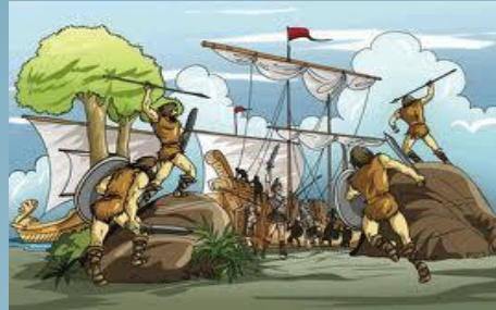
Romans invade Britain – 43AD