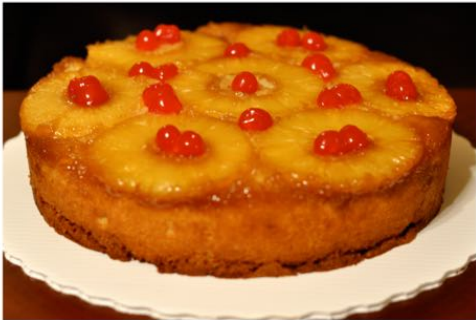
Pineapple Upside Down Cake