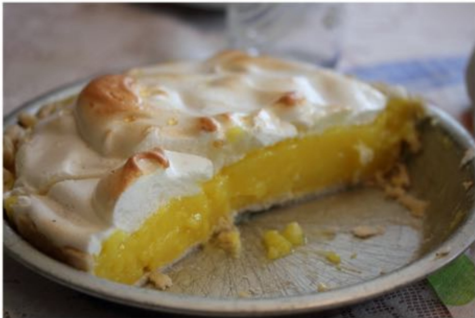
Lemon Meringue Pie