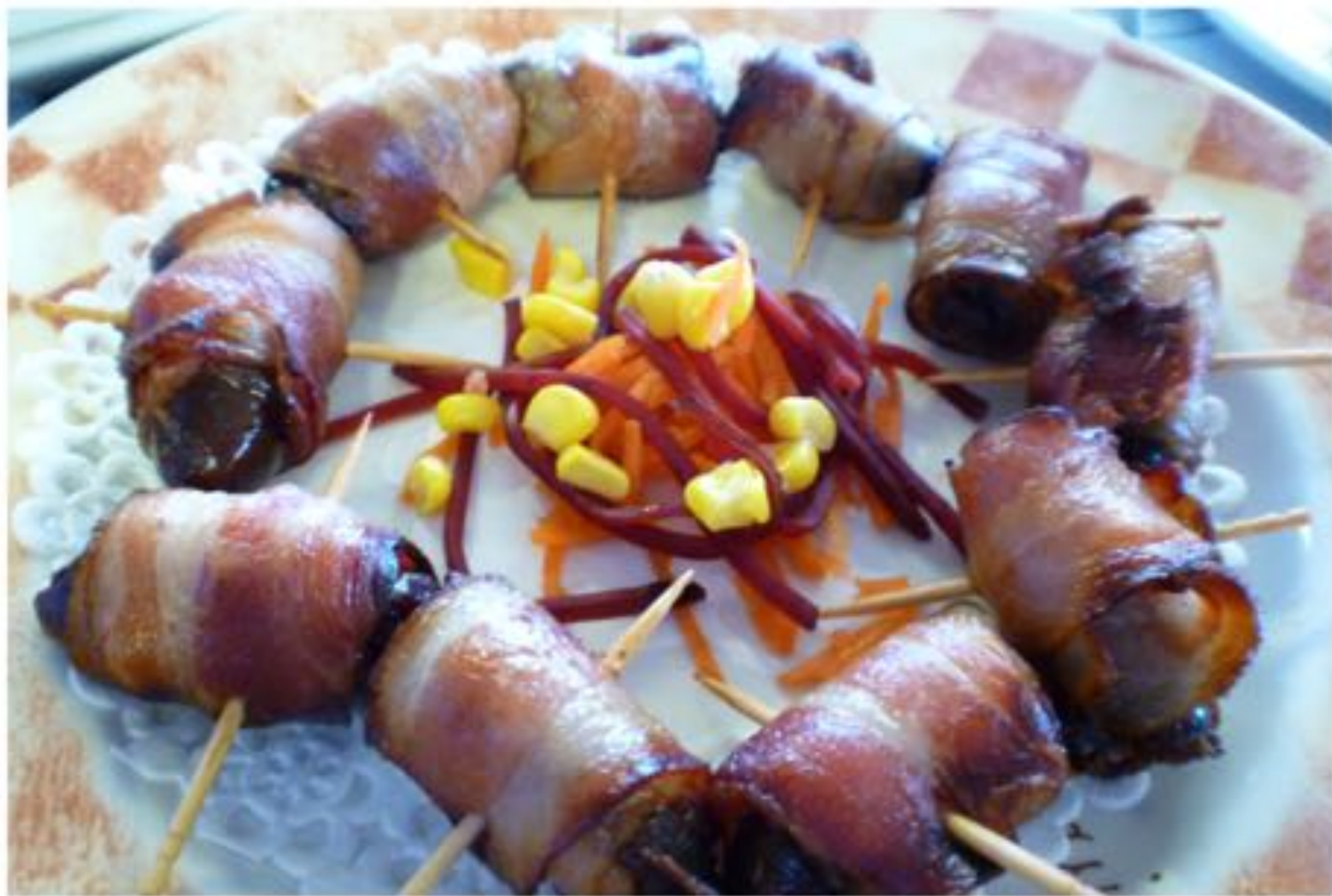
Prunes Wrapped in Bacon