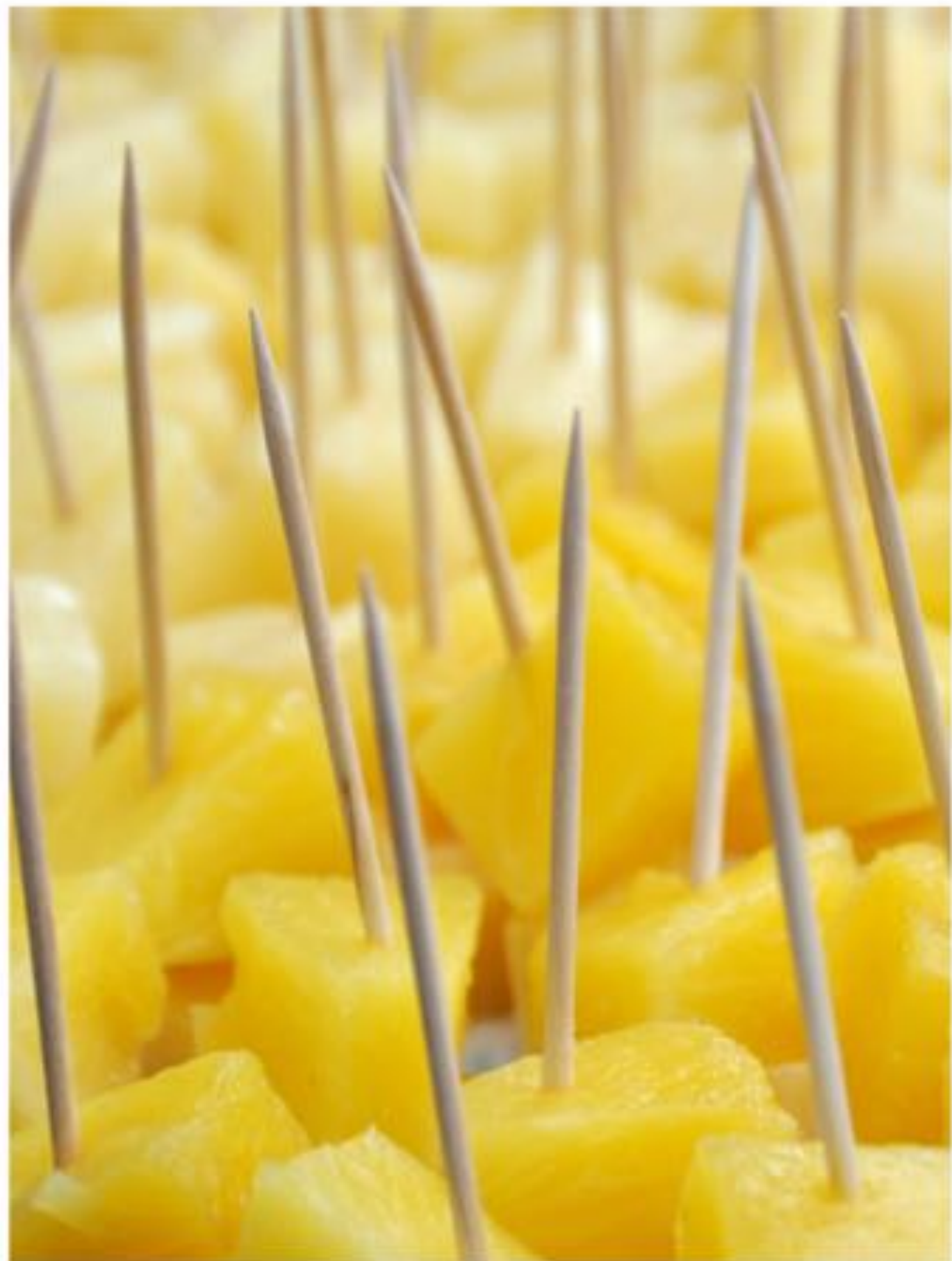
Cheese and Pineapple Sticks