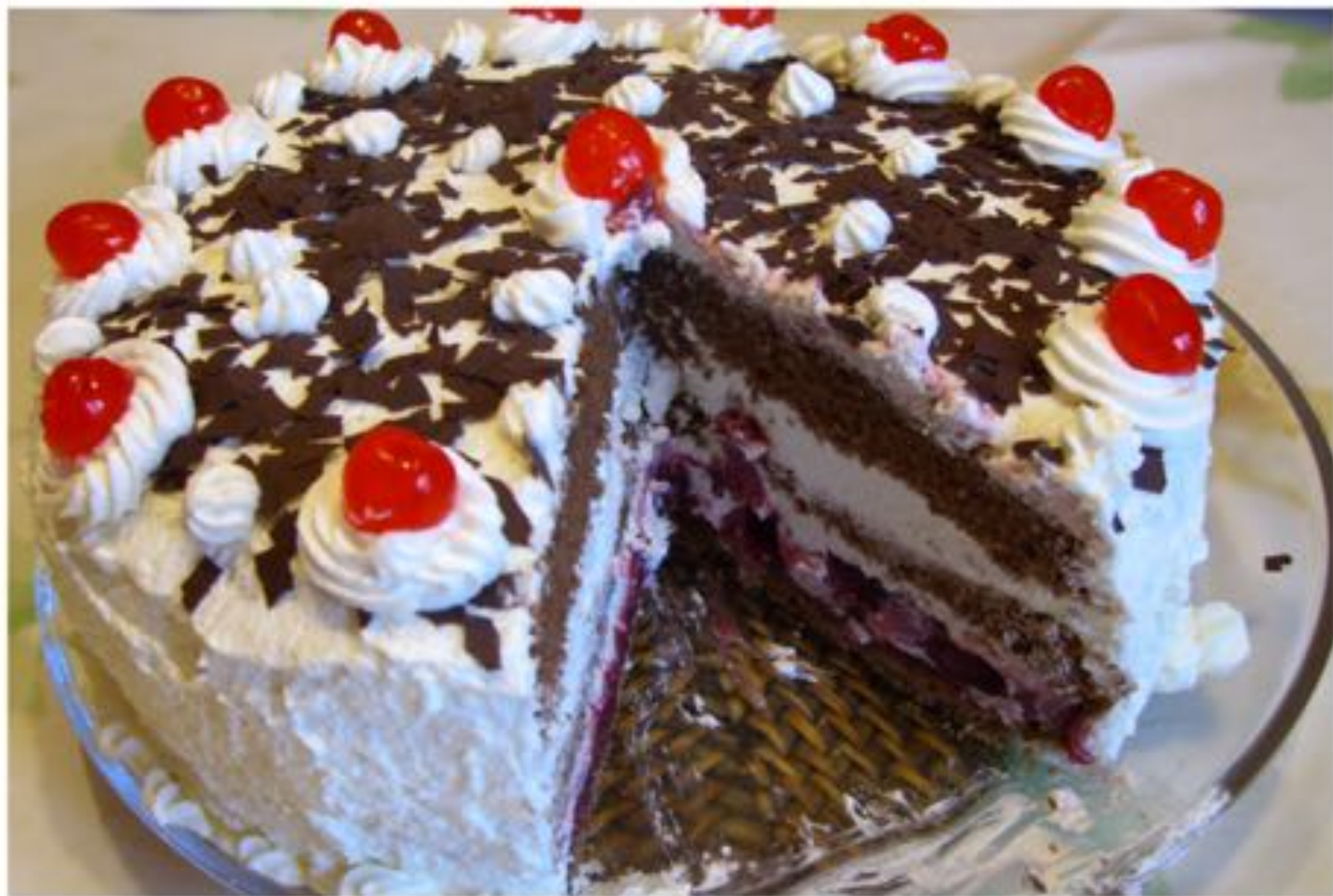
Black Forest Gateau