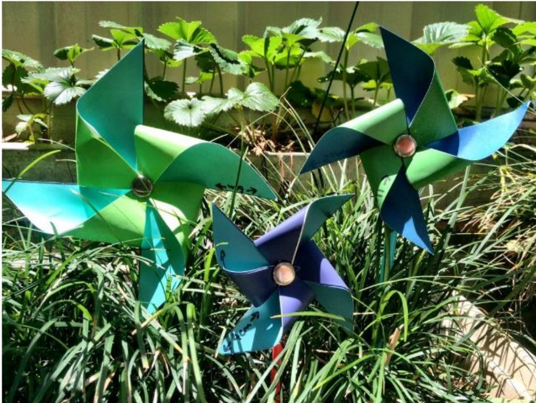
MAKE: Paper Windmills